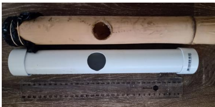
Figure 1: PVC and bamboo pipe traps showing the side entrance.